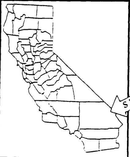
EXHIBIT "A" W 24836 BOUNDARY LINE & TITLE SETTLEMENT AGREEMENT SAN BERNARDINO COUNTY