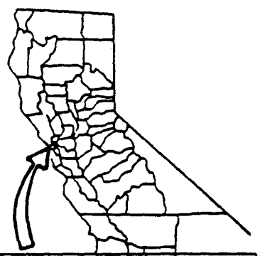
EXHIBIT "A" PRC 6004