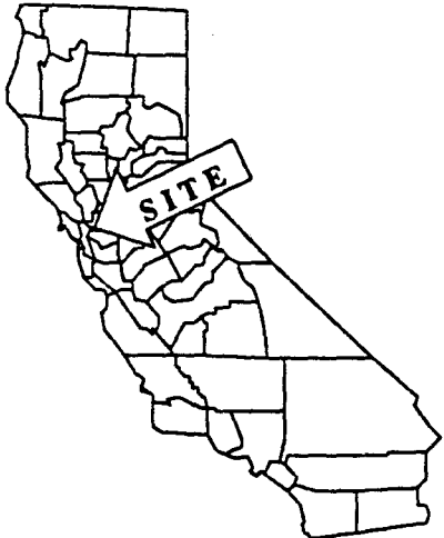
EXHIBIT "A" Site Map W 22708 Bridge House White Slough City of Vallejo SOLANO COUNTY