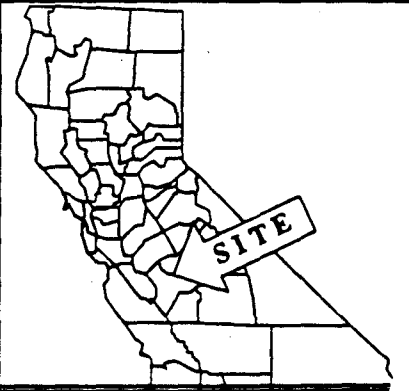
EXHIBIT "A" PRC 5939 Amendment To Dredging Permit San Joaquin River FRESNO COUNTY

This Exhibit is solely for purposes of generally defining the lease premises, and is not intended to be, nor shall it be construed as, a waiver or limitation of any State interest in the subject or any other property.