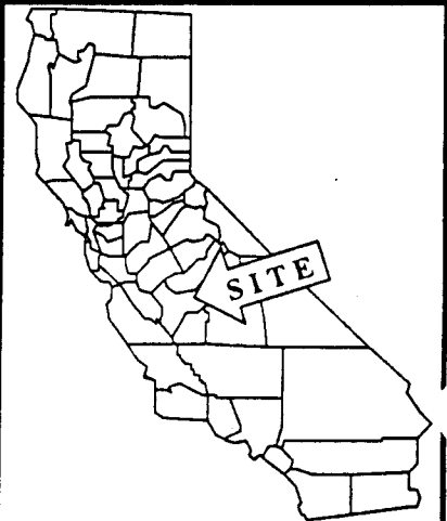
EXHIBIT "B" Site Map W 24893 San Joaquin River FRESNO COUNTY

Portions of Sections 25 & 36 T 11 S, R 20 E, M.D.M.