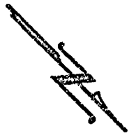
EXHIBIT "B" SITE MAP 514 PALISADES BEACH ROAD PRC 6013 - BLA 205 SANTA MONICA BEACH LOS ANGELES COUNTY