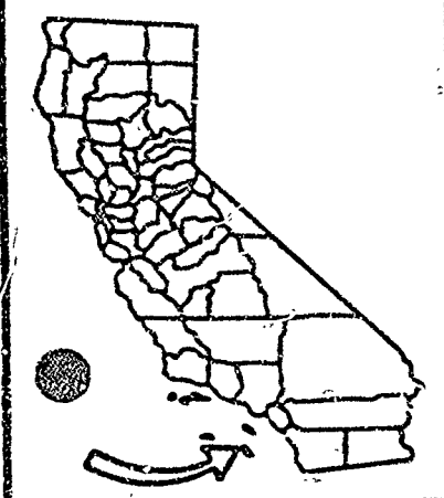
EXHIBIT "B" PRC 6410.1

Santa Barbara Island, Santa Barbara Co., California