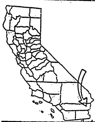
EXHIBIT "B" PRC 7374.2