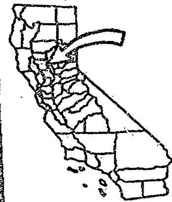
EXHIBIT "B" STATE LANDS COMMISSION QUITCLAIM PRC 6334 State Oil & Gas Lease