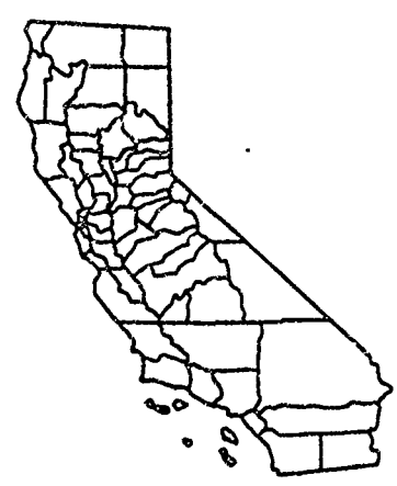
EXHIBIT "A" W 503.0219