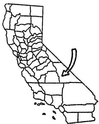
EXHIBIT "A" PRC 4627.2