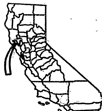
EXHIBIT "B" W 23798