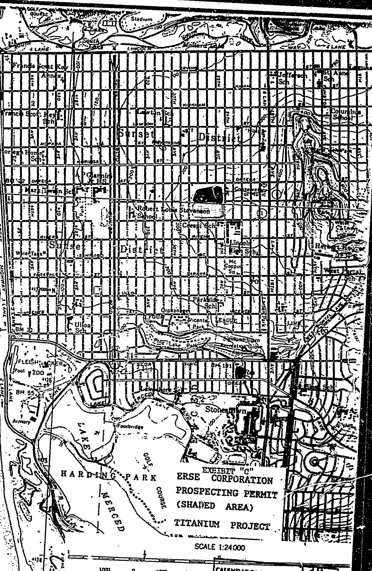
EXHIBIT "C" ERSE CORPORATION PROSPECTING PERMIT (SHADED AREA) TITANIUM PROJECT