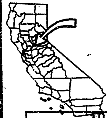
EXHIBIT "C" STATE LANDS COMMISSION W4C506 PROPOSED OIL AND GAS LEASE TXO PRODUCTION CO.

CALENDAR PAGE 103 MINUTE PAGE NO. 1786, 7