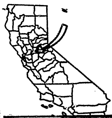
EXHIBIT "B" W 23821, W 23822