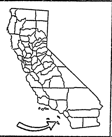
EXHIBIT "B" PRC 6444

San Barbara Channel Islands National Monument Santa Barbara Co.