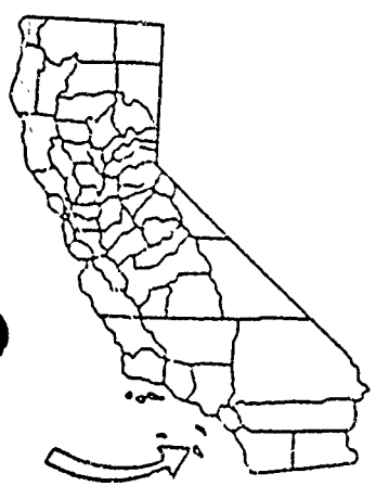
EXHIBIT "B" W 22957,4

Santa Barbara Island Channel Islands SANTA BARBARA CO. CALIFORNIA