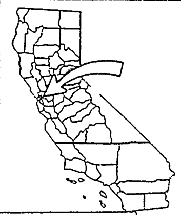
EXHIBIT "E" APPLICATION FOR OIL & GAS LEASE MCFARLAND ENERGY APPLICANT PROPOSED DRILL SITE LOCATION WP 5716 HOLLAND TRACT