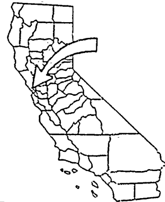
EXHIBIT "A" PROPOSED DREDGING AT PINE GULCH CREEK W 23133 MARIN COUNTY DEPT. OF PARKS & RECREATION

CALENDAR PAGE R.O. 42/82 MINUTE PAGE 438