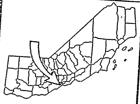
EXHIBIT "B" PROPOSED DREDGING AT PINE GULCH CREEK W 23133 MARIN COUNTY DEPT. OF PARKS & RECREATION