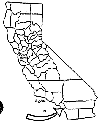
EXHIBIT "B" WP 2069