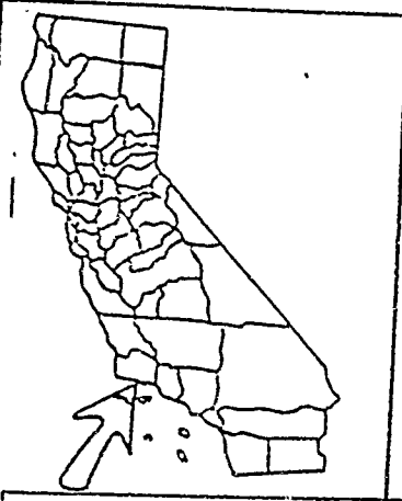
EXHIBIT B WP 2954