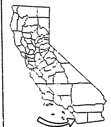
EXHIBIT "B" W 2400,138