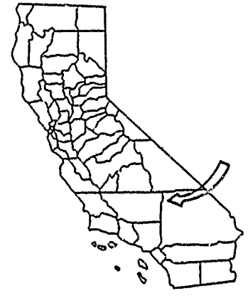
EXHIBIT "A" PRC 3803,2