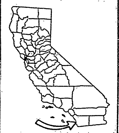
EXHIBIT "B" WP 4008