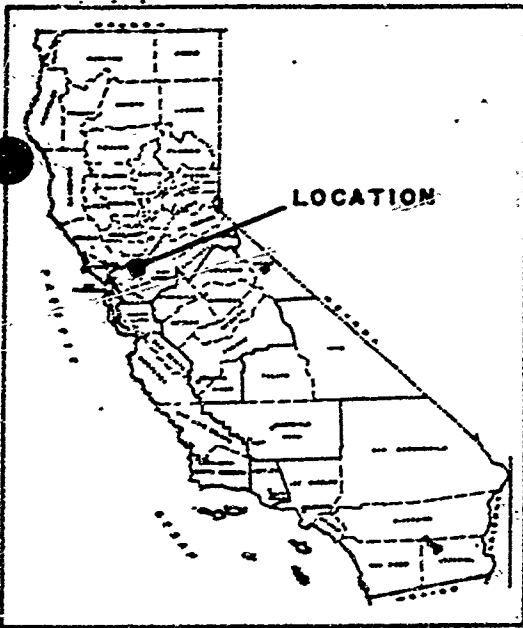
EXHIBIT "A" STATE LANDS COMMISSION W 40257

PROJECT LOCATION MAP R. GREEN, R. REEDY: APPLICANTS