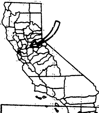
EXHIBIT "B" W 2015