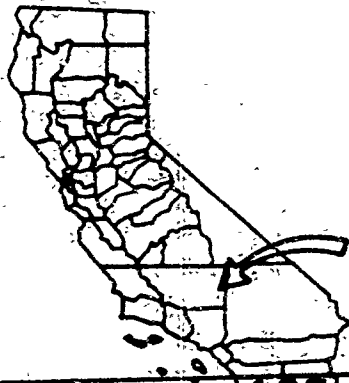
EXHIBIT "B" W 40267