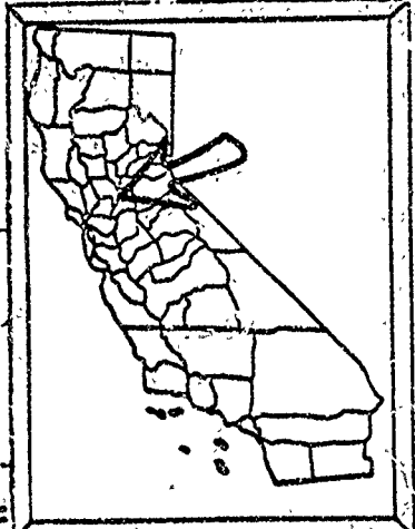
EXHIBIT B WP 4157