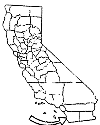
EXHIBIT "A" WP 5187