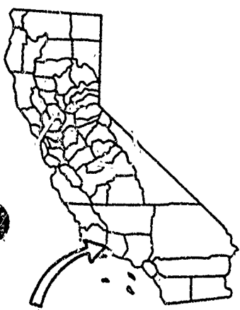
EXHIBIT "C" W 2400.132