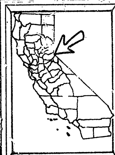
EXHIBIT 'B' N 128 057 1717