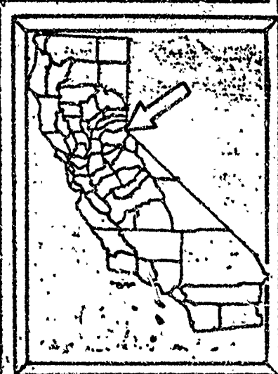
EXHIBIT "B" WP 4240 20 CALENDAR PAGE MINUTE PAGE 767