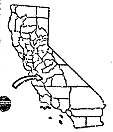
EXHIBIT "A" WP 4197