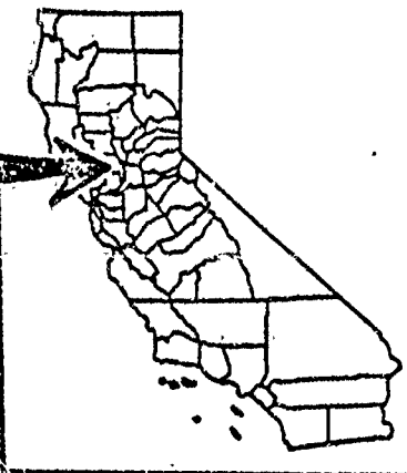
EXHIBIT "B" W 21681