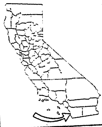
EXHIBIT "A" W 503.1015