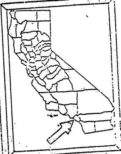
EXHIBIT 'A' SAN W. - WP 4895 023 2778 MINUTE OF