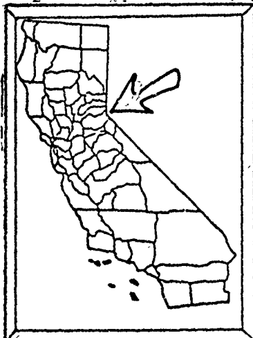
EXHIBIT "B" WP 3545