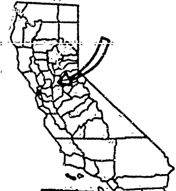
EXHIBIT "A" W 503.1001