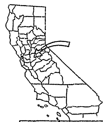
EXHIBIT "B" W 2400.122