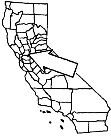
EXHIBIT "A" W 503.937