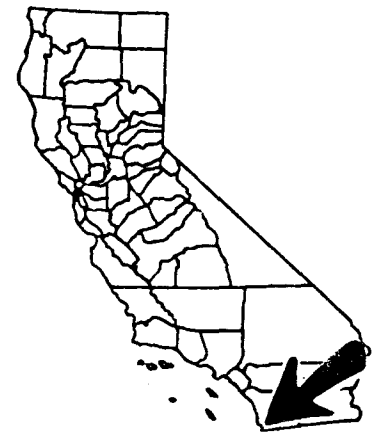
EXHIBIT "A" W 503.905