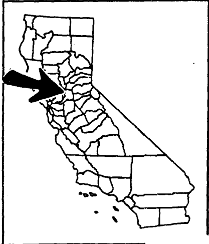
EXHIBIT "B" W 21709