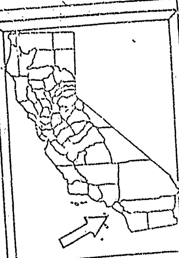
EXHIBIT 'A' WP 4193