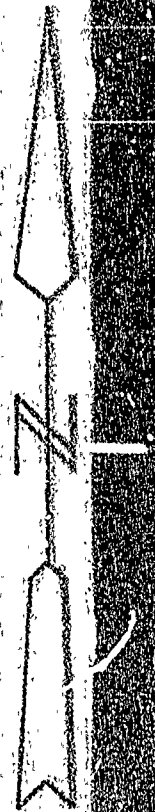
EXHIBIT "B" W 21719