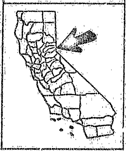
EXHIBIT 'B' W 21725