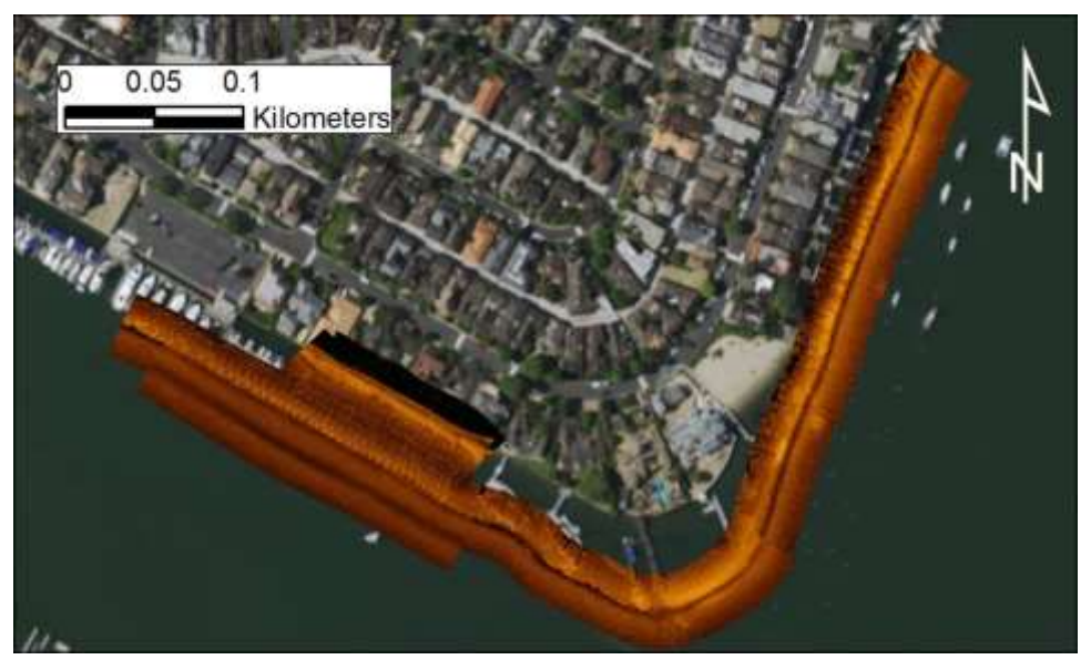
FIGURE 1. AREA SURVEYED BY SIDE SCAN SURVEY DURING THE APRIL 5, 2016 INFLATABLE DEPLOYMENT TEST. SIDE SCAN IMAGERY REPRESENTED BY BROWN SHADING.