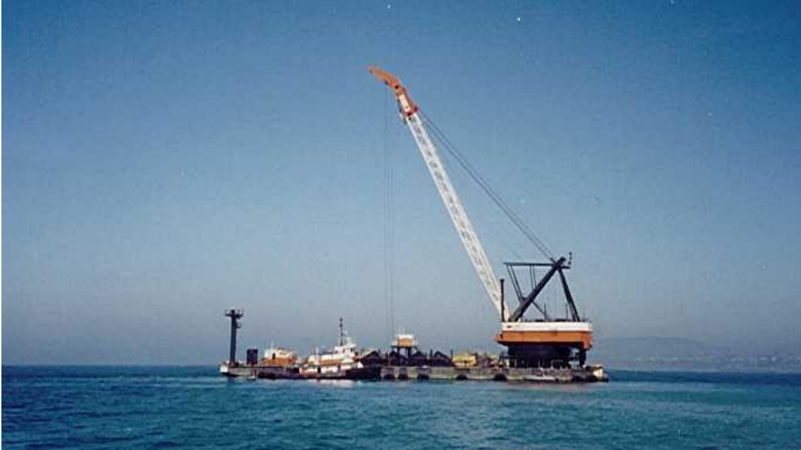
Figure A-1. Derrick barge.