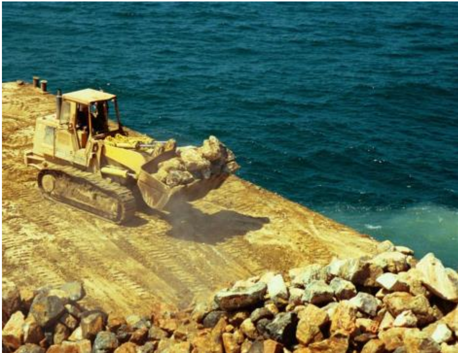
Figure A-2. Rock placement method; front-end loader/flat supply-barge “push off” method.