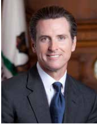
GAVIN NEWSOM Lieutenant Governor